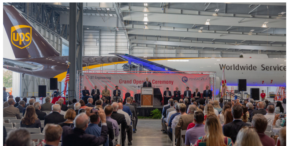
VT MAE Grand Opening, Pensacola, Florida