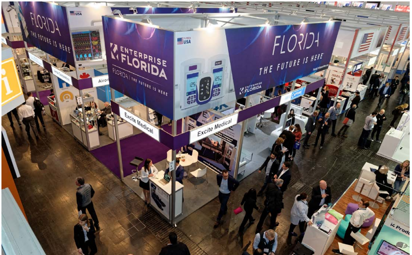
Florida Pavilion, MEDICA Trade Show, Düsseldorf, Germany