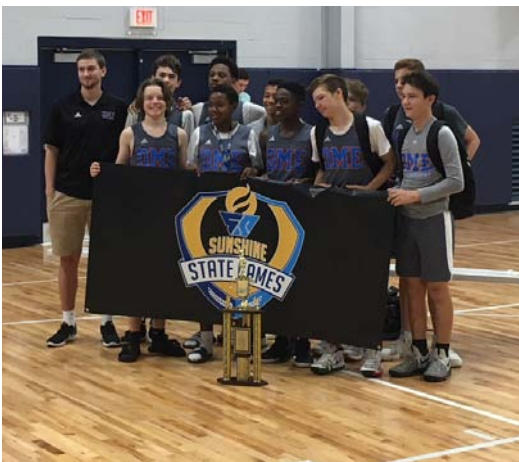
Sunshine State Games Basketball Tournament in Gainesville, May 2018