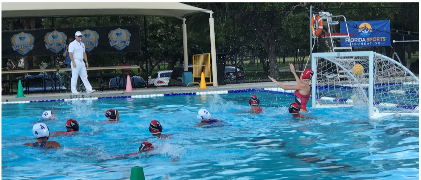
South Florida Water Polo 16U Teams: Coral Springs & Pompano Beach, June 2018

* The FSF grant programs work to assist communities and organizations in attracting major sporting events. These events are designed to attract out-of-state visitors and generate a significant economic impact. Grants are awarded for events that are projected to have strong economic impacts, a positive return on investment, garner community support and add value to the state of Florida.