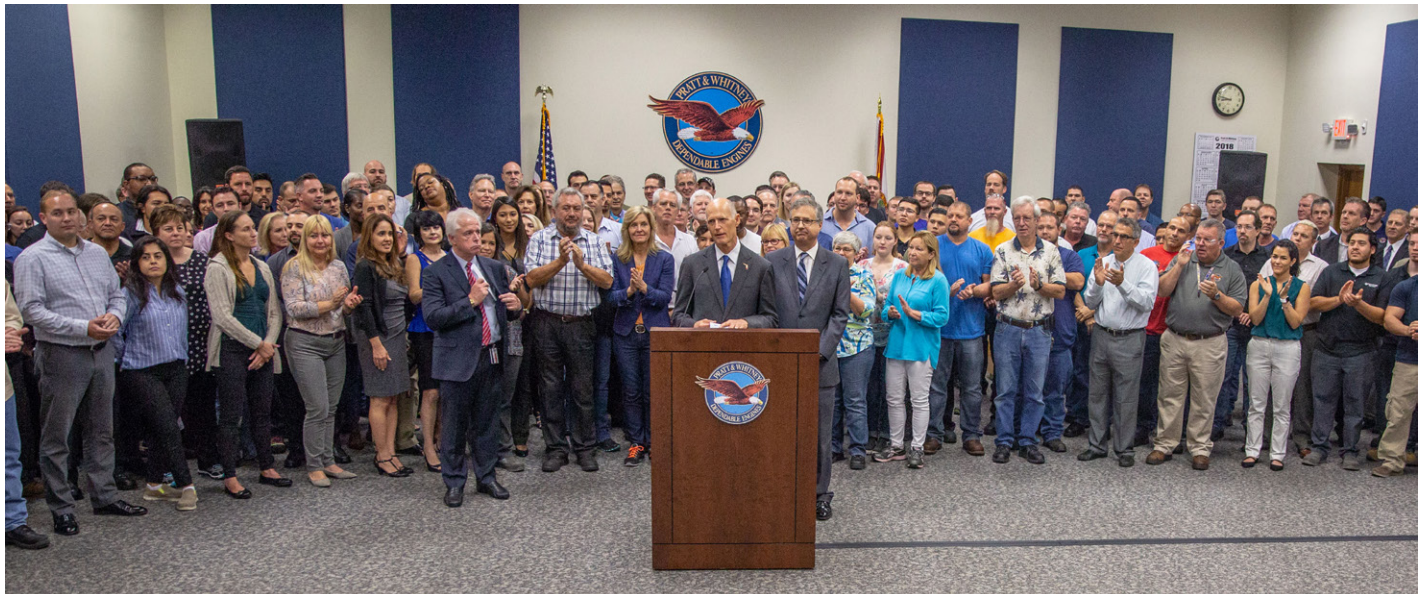
Pratt & Whitney, Jupiter, Florida