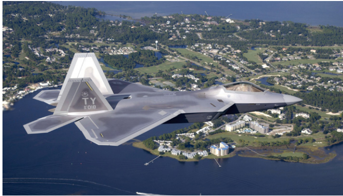
F/A-22 Raptor over Florida

Enterprise Florida's mission to preserve and protect military installations to support the state's position in research and development related to or arising out of military missions and contracting is achieved through the initiatives of the Florida Defense Alliance and the Florida Defense Support Task Force. Both entities strive to improve the state's military-friendly environment for service members, military dependents, military retirees, and businesses that bring military and base-related jobs to the state. Florida is home to 20 major military installations with an economic impact of $84.9 billion annually and over 800,000 jobs. Florida is also home to 1.5 million military veterans and retirees.